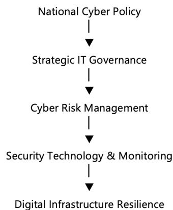
Figure 2. National Cybersecurity Governance Strategy Model

Strengthening cybersecurity governance also requires a collaborative approach between the government, the private sector, and national cybersecurity agencies. This collaboration is important to build a stronger cybersecurity ecosystem and improve the country's ability to deal with global cyber threats (Kshetri, 2022; Setiawan & Nugroho, 2021). This approach is also in line with the concept of cyber resilience which emphasizes the importance of the ability of digital systems to survive, adapt, and recover from cyber attacks (Ahmad et al., 2020).